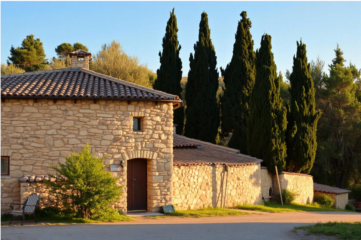
The restored stone farmhouse and 1.2-acre medicinal garden, Bat Shlomo

A Jewish holistic health sanctuary in the Galilee