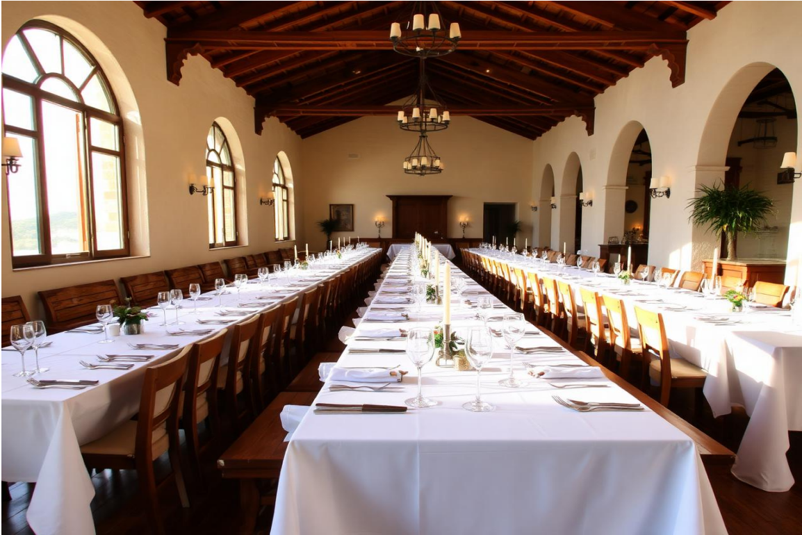
Farm-to-table café kitchen, sourcing from the medicinal garden