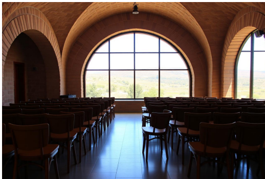
Conference center — 120 seats with breakout space