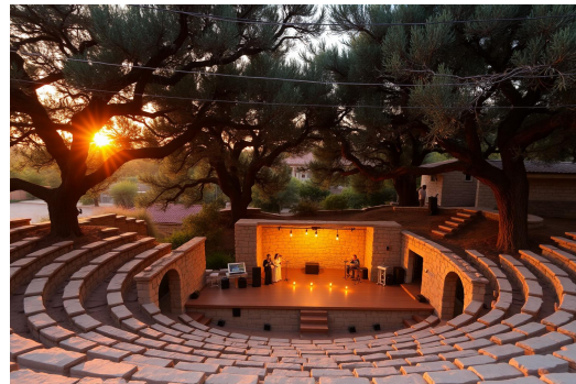
Olive pavilion — healing concerts & gatherings