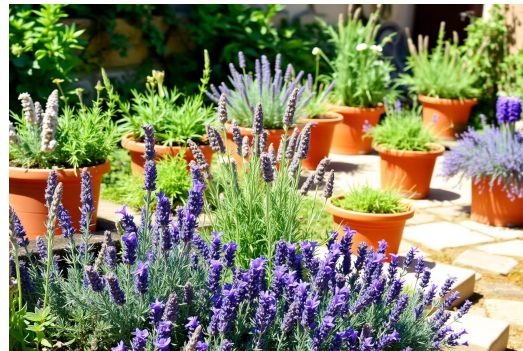
1.2 acres of medicinal gardens with Holy Land Herbs