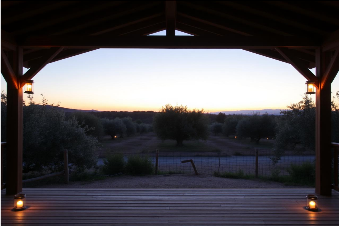
Resident practitioners and apprentices in the gardens